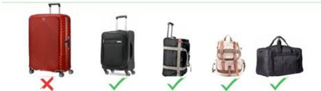
HARD-SIDED BAGS NOT PERMITTED