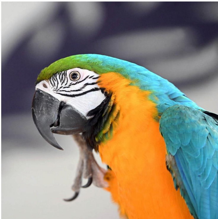
Blue and Yellow Macaw