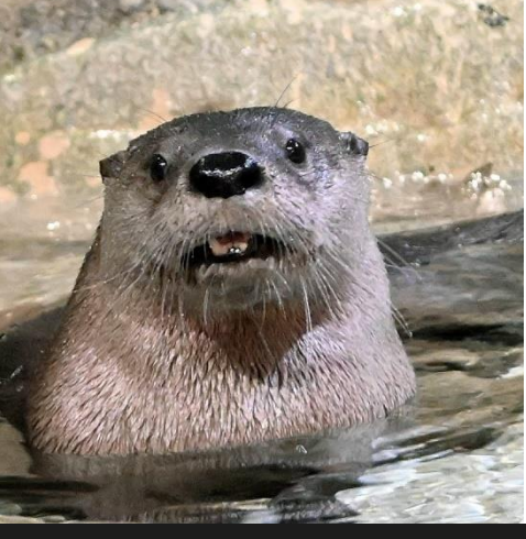
North American Otter