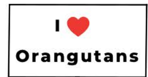
Sign of Support

Tip: After you cut around and cut out the center of the orangutan mask, glue or tape your holder on the side of the mask.