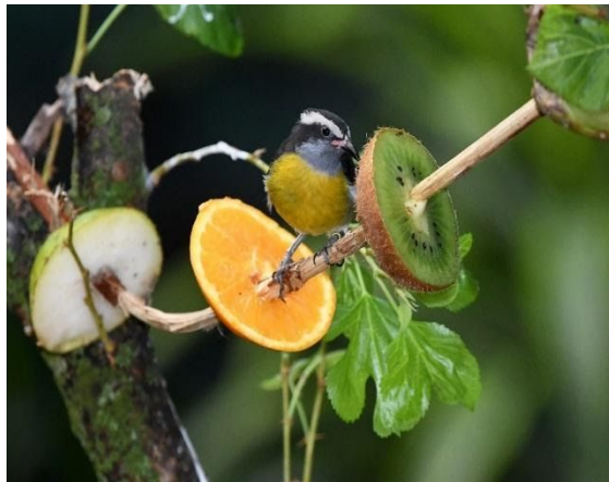
Bananaquit/ Coereba flaveola

Please share your moments on social media: Download the BZ Rewards App in your app store to win prizes Facebook: Facebook.com/BrookfieldZoo Instagram: Instagram.com/BrookfieldZoo Twitter: Twitter.com/Brookfield_Zoo