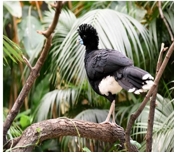
Blue-billed Curassow/ Crax alberti