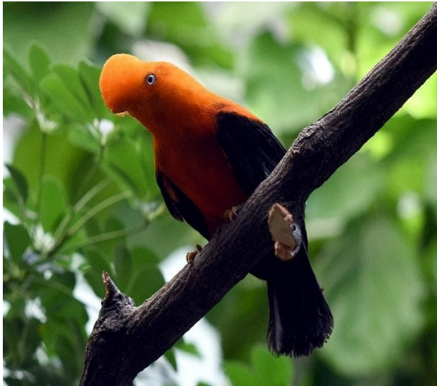
Andean Cock-of-the-Rock/ Rupicola peruvianus