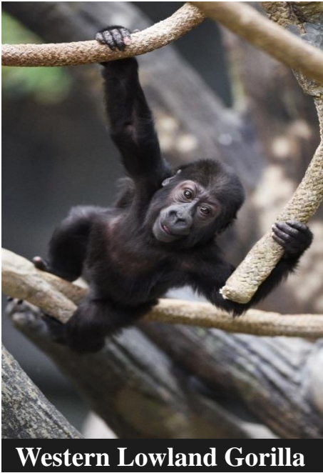
Western Lowland Gorilla