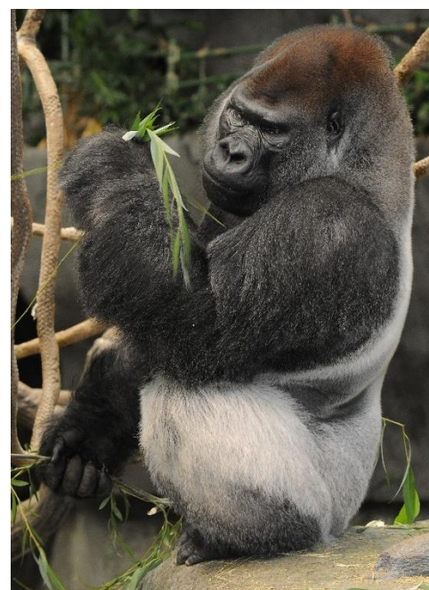
Western Lowland Gorilla

Read on for Frequently Asked Questions, a map, and your waiver.