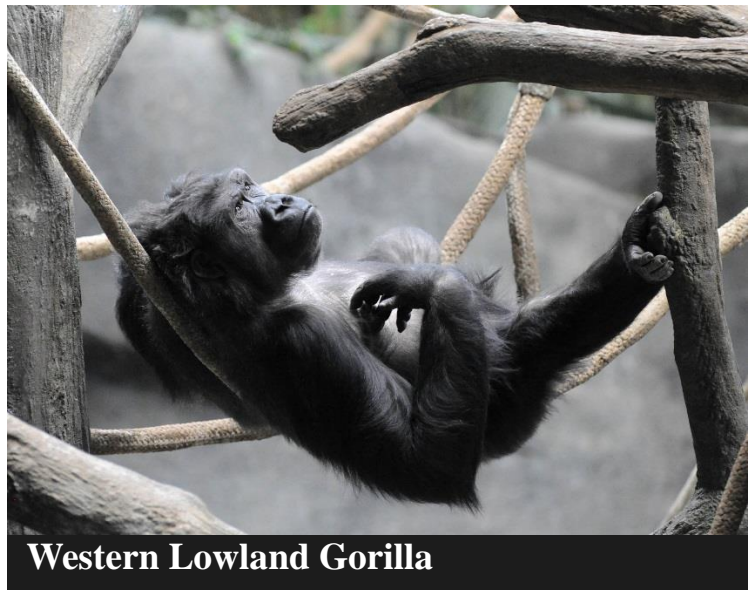
Western Lowland Gorilla

These are some of the most commonly asked questions we get from our guests. If you think of something else or need clarification on anything in this packet, please don't hesitate to call the Education department at 708-688-8430 or send us an e-mail at backstageadventures@czs.org .