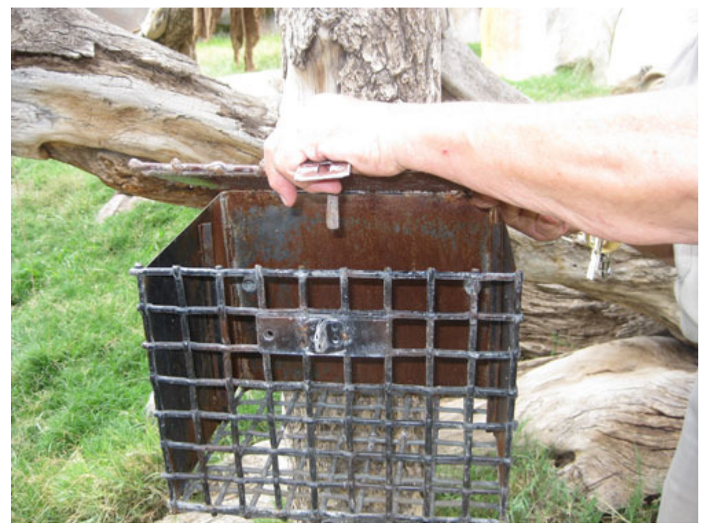
Henry's Puzzle Paradise (Sally Singleton – El Paso Zoo)