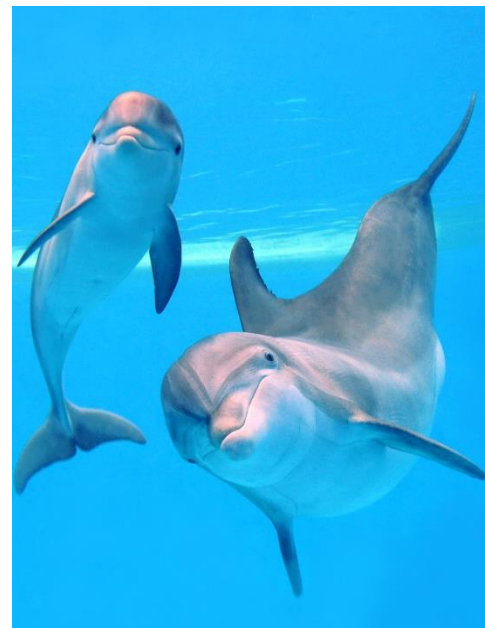
Atlantic Bottlenose Dolphin