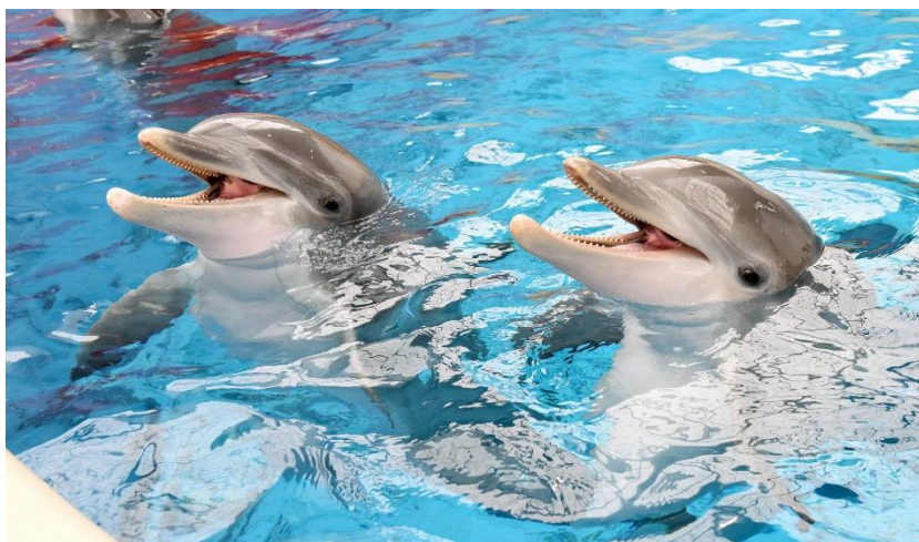
Tapeko and Merlin Dolphin

All participants are required to complete a signed liability waiver (page 4). Read on for Frequently Asked Questions, a map, and your waiver.