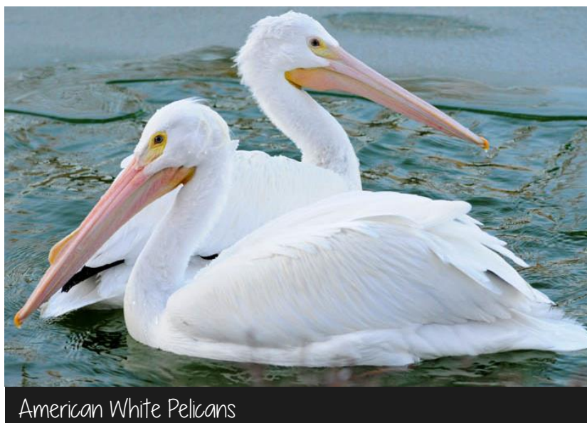
American White Pelicans