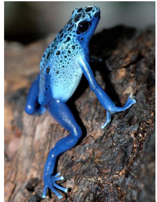
Poison Dart Frog