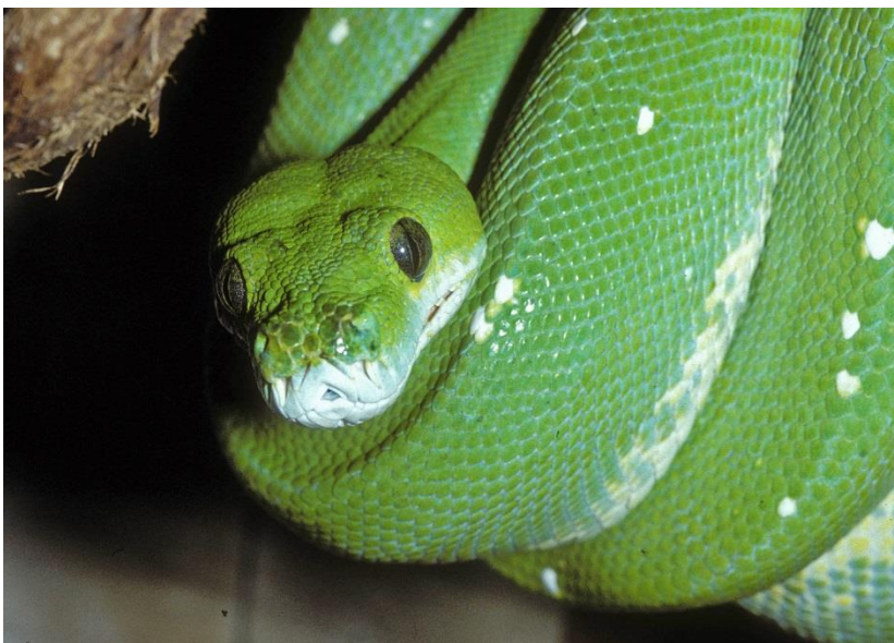
Green Tree Python

Read on for Frequently Asked Questions, a map, and your waiver.