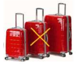
HARD SIDED BAGS NOT PERMITTED