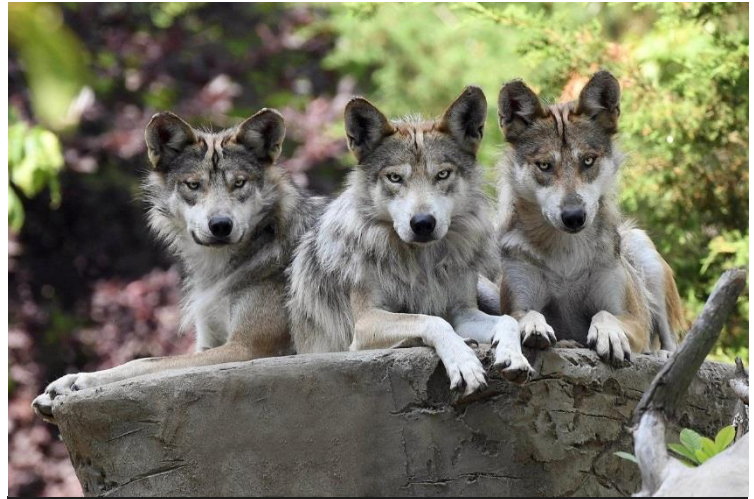
Mexican Gray Wolves

These are some of the most commonly asked questions we get from our guests. If you think of something else or need clarification on anything in this packet, please don't hesitate to call the Education department at 708-688-8430 or send us an e-mail at backstageadventures@czs.org .