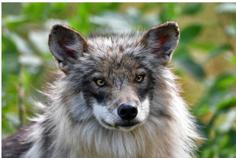
Mexican Gray Wolf

Not all of our programs are fully accessible, but at Brookfield Zoo we value the diversity of our guests and strive to facilitate the best connections with wildlife and nature possible. If you require any accommodation to participate in this program, please contact the Customer Service Representative at 708-688-8342 Monday through Friday from 9:00 a.m. to 4:00 p.m. or send us an e-mail at backstageadventures@czs.org .