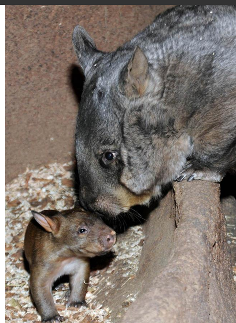
Southern Hairy-nosed Wombat

Read on for Frequently Asked Questions, a map, and your waiver.