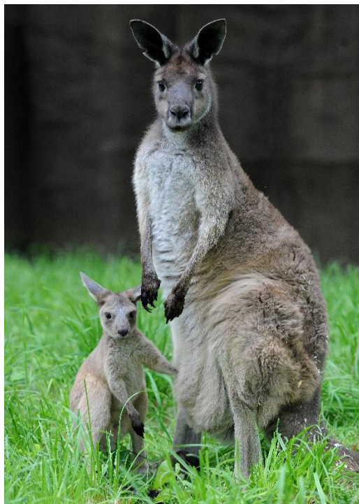
Western Gray Kangaroo