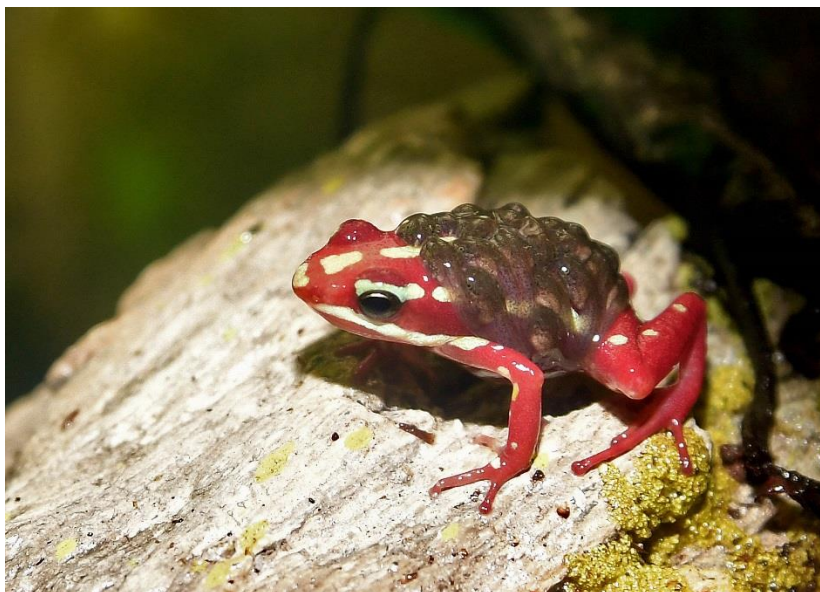
Anthony's Dart Frog

Not all of our programs are fully accessible, but at Brookfield Zoo we value the diversity of our guests and strive to facilitate the best connections with wildlife and nature possible. If you require any accommodation to participate in this program, please contact us at 708-688-8342 Monday through Friday from 9:00 a.m. to 4:00 p.m. or send us an e-mail at adventuresinlearning@czs.org .