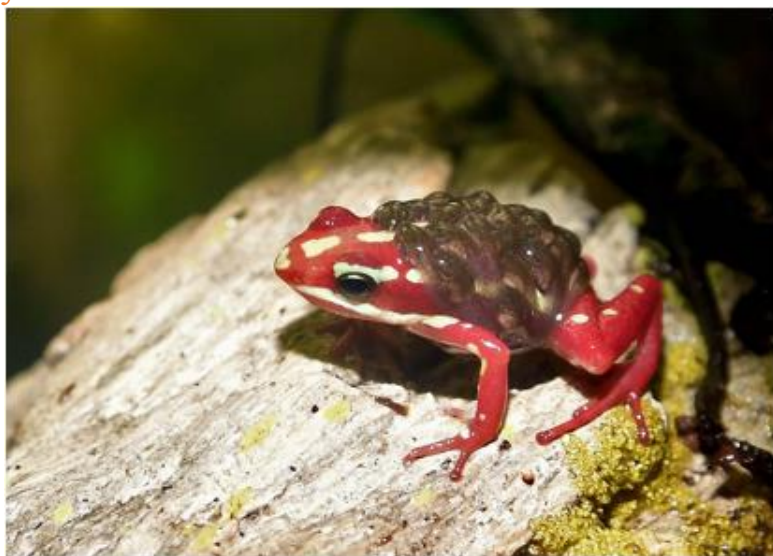
Anthony's Dart Frog

Read on for Frequently Asked Questions , a map , and your waiver .